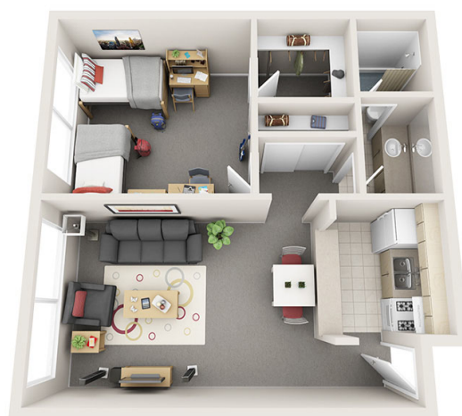
TROY EAST TYPICAL 1 BEDROOM APT PLAN

More information, including links to all the services offered by USC Auxiliary Services can be found on our website at housing.usc.edu