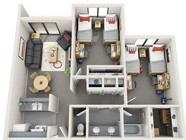
TROY EAST TYPICAL 2 BEDROOM APT PLAN

* Information, including rents, is accurate as of the time of publication. The availability of listed housing accommodations and programs are subject to change based on local health authority restrictions and guidelines.